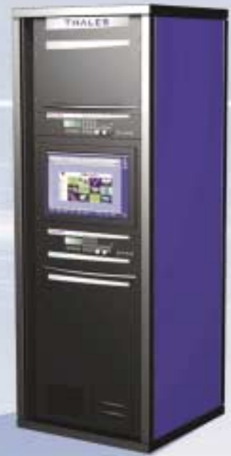
The ECHINOPS operation centre (infrastructure version)